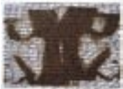
Front: Installation by Paul Bancell. Part of Tryptic , an exhibition at the 2011 Milwaukee Avenue Arts Festival