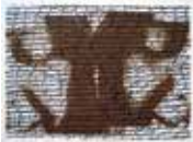
Front: Installation by Paul Bancell. Part of Tryptic , an exhibition at the 2011 Milwaukee Avenue Arts Festival